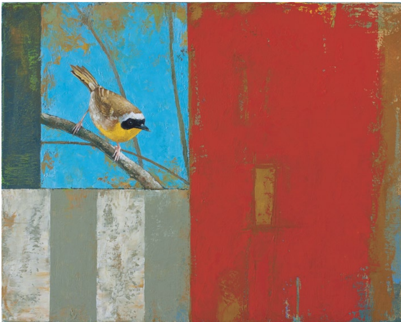
BYRON GIN, COMMON YELLOWTHROAT, OIL ON CANVAS, 16 X 20"

Gin's new work is inspired by the things around him—birds in his backyard, locks on a table at a flea market, etc. It also is informed by the paint itself and "by the process of discovery that comes from layering and manipulating paint on canvas." He also remarks that his goal is to invite viewers to look and appreciate looking at his paintings.