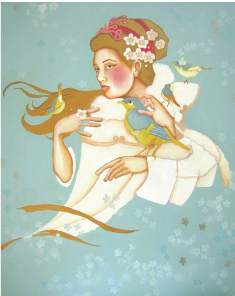
TISHA WEDDINGTON, WINTERBIRD, OIL ON CANVAS, 30 X 24"

“Maybe first the subject attracts the eye—a bird or subject so common it often goes unseen. Next, to the paint itself, the colors, textures, and layers, and to appreciate looking at the paint simply as paint,” says Gin. “ Landing embodies this goal. It focuses on the ubiquitous gull removed of its natural surroundings, to be appreciated anew, while the subtle marks and the variations of color draw the viewer into a contemplation of the paint surface.”